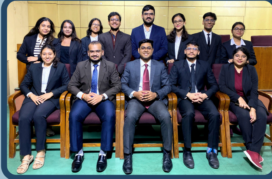
OFFICE BEARERS OF THE MCC (2024-2025)